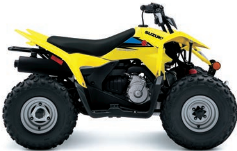
Champion Yellow No.2 (YU1)